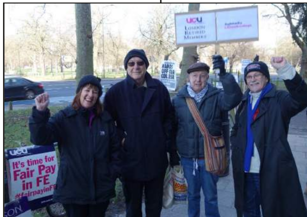
London Retired Members on the Lambeth Picket

and do not forget that the Mayor still wants to axe 900 jobs on the Underground.